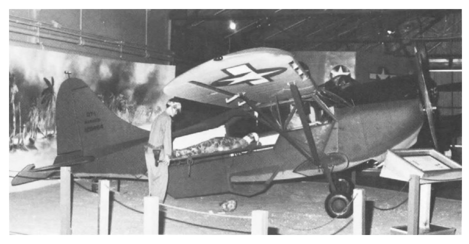
In addition to its use as an artillery spotting platform, the OY-2 Sentinel was also valuable to Marine combat troops for the medical evacuation capabilities it provided.

The Sentinel on display at the Marine Corps Air-Ground Museum was originally an OY-1 (Bureau No. 120454) which was redesignated an OY-2 after undergoing the 24-volt electrical system retrofit. It saw service with VMOs-1 and -6.