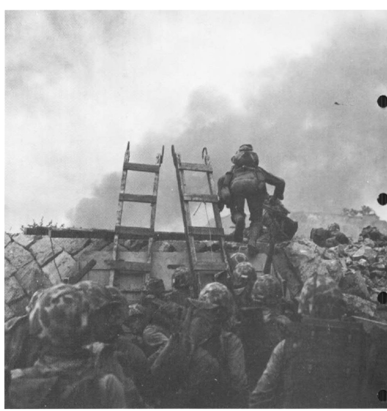
In a much reprinted photograph, men of the 1st Marine Division mount scaling ladders and storm over the seawall to consolidate the Inchon beachhead on 15 September, swiftly completing one of "the fastest operations on record" and taking few casualties.

Men on their way to reinforce lst Division front lines northeast of Inchon on 17 September pause to look over a knocked-out and still-smoldering North Korean T-34 tank in their path.