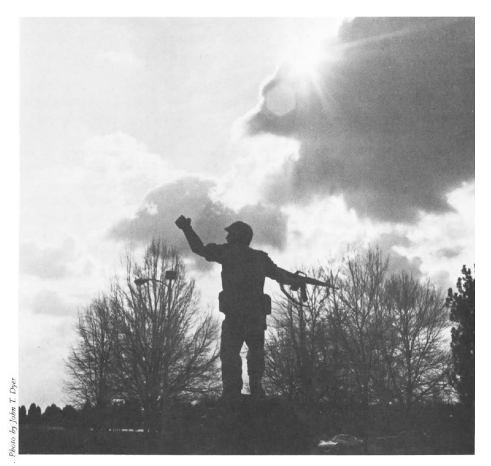
The Leftwich Statue memorializes Marine Corps leadership as exemplified by LtCol Leftwich's "tactical skill, bold fighting spirit, and unflagging devotion to duty."

ed. He also showed me the granite boulders that were intended for the base of the statue.